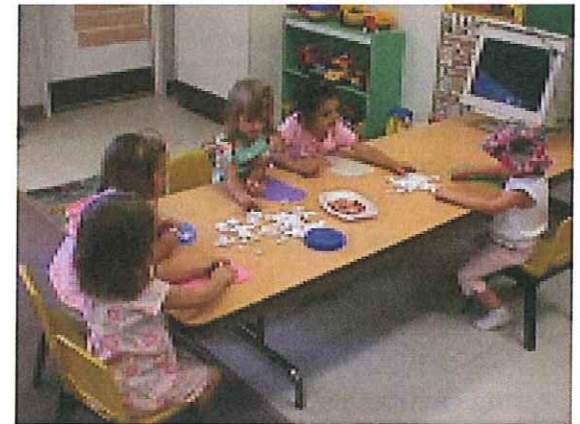
Children's "work" is "play"